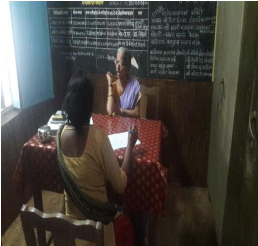
Headmastress of Kelbaiwada Primary School, Kelbaiwada, Mayem giving information about their Primary School to our Team.