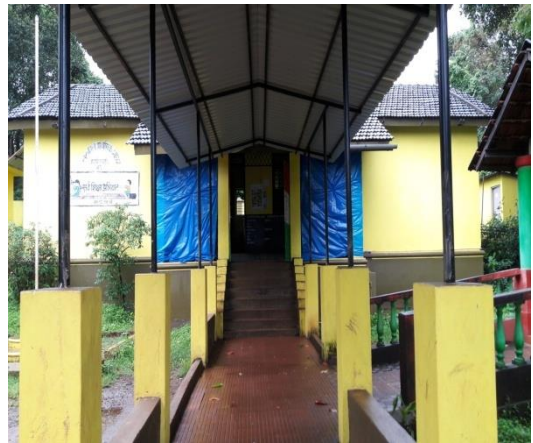
HALDANWADI PRIMARY SCHOOL