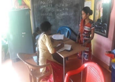
ANGANWADI POIRA ANGANWADI