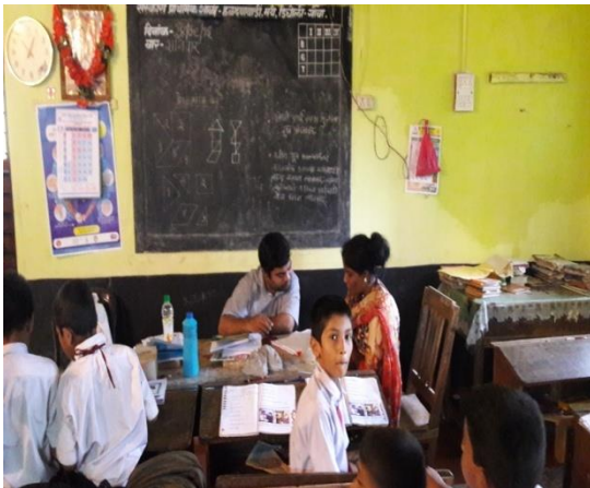
Teacher of Haldanwadi Primary School giving information about their Primary School tour Team.